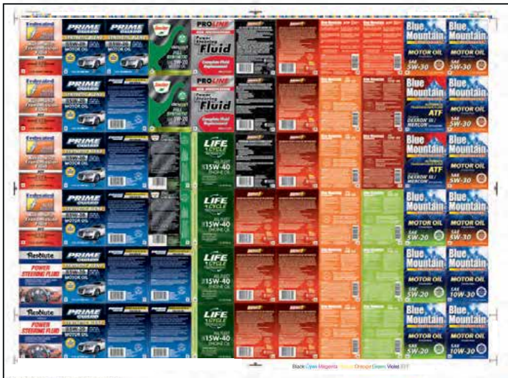
Expanded Gamut combo press runs give you amazing color and flexibility

We understand the importance of giving you options when it comes to printing. Gamse's package decorating solutions are tailored to your needs.